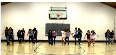
▲ An intense 3-legged race at FUSION!

Cedar Point in August • See You at the Pole Rally and His Name High Concert in September • Acquire the Fire in October • Youth Band leads Sunday's worship in November