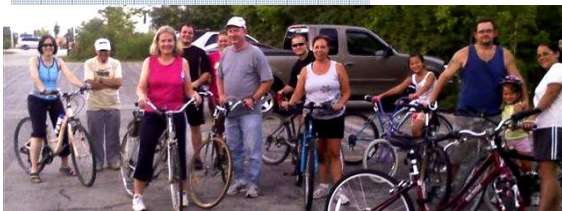
▲ The first of four bike hikes this summer, hitting the Tow Path trails